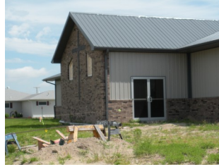
Outside of new building.

The building features a sanctuary and fellowship hall, a kitchen, restrooms, nursery, conference room and pastors' study.