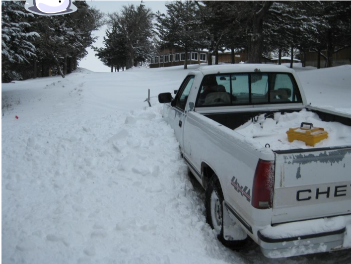
It can be a little harder getting to Weaver Hall in the winter than in the summer!