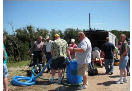
At their Moses Merrill Conference, ABMen received training on new disaster response equipment.