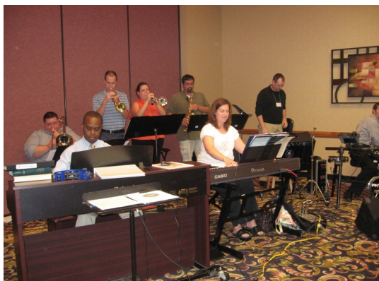
Just some of the great musicians from New Life Baptist Church in Bellevue who provided music throughout the convention.