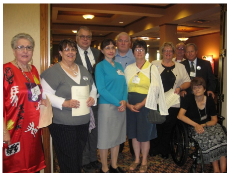
Members of Host Church Welcome Team FBC, Beatrice