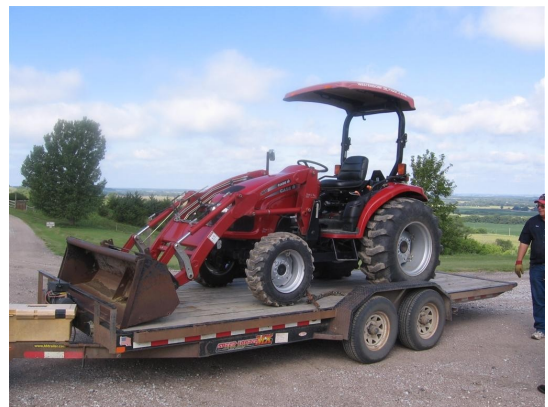
The "new" tractor arrives at Moses Merrill

The camp had maintained four very old tractors of different sizes for different jobs. A donor made it possible to replace the largest tractor late last year. The tractor given by ABMen replaces the two oldest tractors. According to Reiss this is a major improvement in the ability of the staff to care for the property.