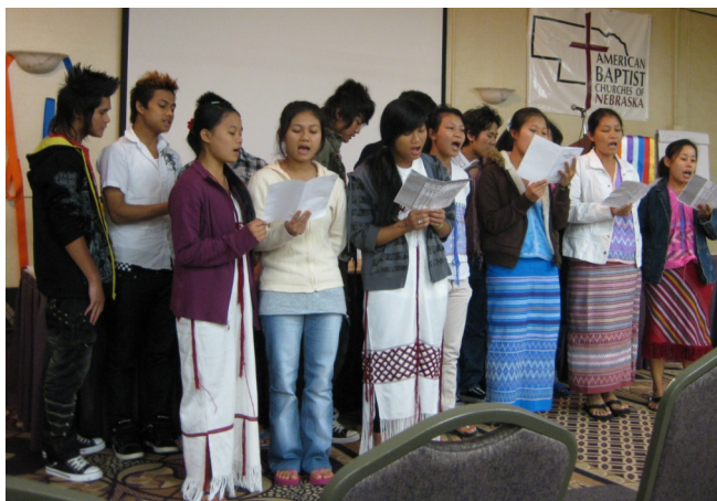
American Baptist Karen Congregation Youth Choir.

RIBBONS: On any given Sunday, worship is held in ABC/NE churches in eight languages. The ribbons seen on the front of the podium represented the eight languages plus one additional ribbon for whatever is the next language!