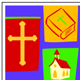
October is Pastor Appreciation Month

Pastors in our denomination are becoming a rare and therefore very valuable resource for the church. We treat valuables differently than we treat everyday things. We protect them, we care for them, we cherish them and we honor them.