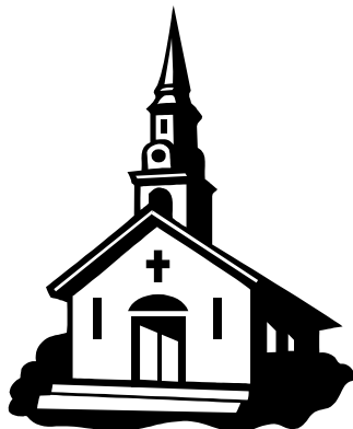
Local Church News

OMAHA, PARKSIDE BAPTIST: Christmas events: The ABW Ministries held a supper and Christmas program for the entire church family on Dec. 6 and hosted a party for the Solomon Girls on Dec. 11; A Kid's Christmas Party was held on Dec. 14; caroling for shut-ins was on Dec. 15, a Christmas Candle-lighting Service was held on Dec. 24. Church members helped ring bells for the Salvation Army. The church is collecting used cell phones to be distributed to victims of domestic violence. [The ABC of Nebraska staff thanks Parkside for hosting the region staff Christmas dinner! It was wonderful!] Parkside hosted the Omahaland ABMen's Breakfast in January.