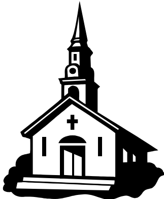
Local Church News