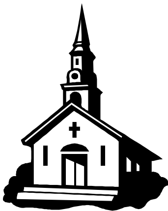
Local Church News