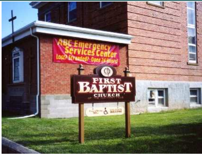
The ABC Emergency Service Center is headquartered at First Baptist Church of the Northern Hills in Deadwood, SD