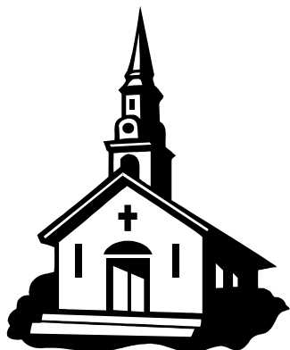
Local Church News

TECUMSEH, FBC: The youth held a car wash to add funds to the camp scholarship fund. The youth who are going to use the funds provided the muscle for the car wash. Graduates were honored on May 5, and all ladies above high school age received a gift on Mother's Day. Sunday School for grades K-8 will be combined for the summer months. Fifty-nine persons who had volunteered to help in Christian Education Ministries during the past year were honored at a supper on April 14. FBC held church service at the Tecumseh Prison on May 12.