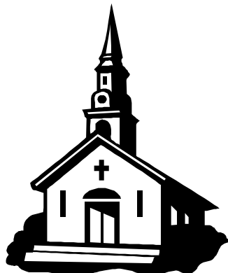
Local Church News

Alliance, FBC: The ABY is continuing in the video Bible study Velocity. A special Palm Sunday worship with students and teachers on April 13. Maundy Thursday communion was held in the Chapel. The Northwestern Association met April 19 with all Association churches represented. The ABY sponsored an Easter breakfast that was well attended.