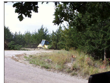
Trees being removed