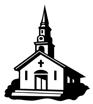
Local Church News

TECUMSEH, FBC: Six Awana students, who finished their books during the year, and a sponsor went to Omaha to the Zoo on May 18. White Cross work is done on the last Tuesday of each month. Sunday School Promotion and the annual church picnic was held June 2.