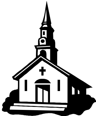
Local Church News

TEKAMAH, FBC: S.C.U.B.A. (Super Cool Underwater Bible Adventure) Vacation Bible School was held June 9-13, concluding with two programs on the 13 th . A garage and bake sale was held on June 21 by the Women's Society and the Church Fellowship Committee. Items were collected in both June and July for the community food pantry. FBC youth participate in the "Student Venture" gatherings in Tekamah. A "Musical Feast and Ice Cream Social" was hosted by FBC and Riverside on July 20 for Omahaland churches.