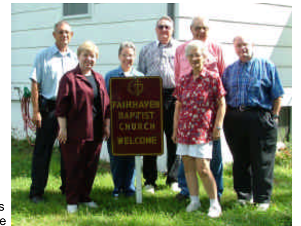
The NEW LIFE CARAVAN continues its visits to ABC/NE churches. The Caravan recently stopped at Fairhaven Baptist near Lexington.

Next we wanted to gather data from churches about needs they had and gifts they thought they could share. We chose the Region Staff Caravan as the vehicle to accomplish this and we are currently part way through those visits. Let me share with you some of the things we have learned.