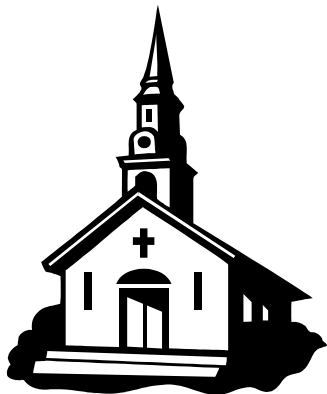
Local Church News