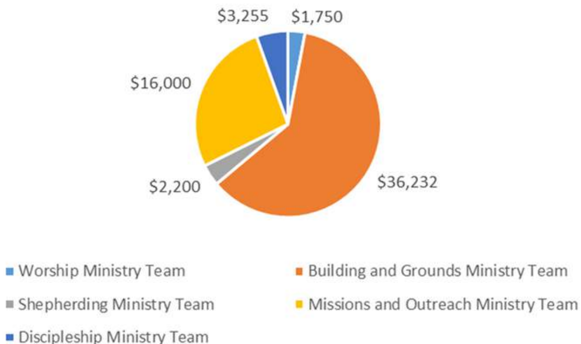
First Baptist Church Budget by Ministry Teams

Each of the five ministry teams (see next page) have budget authority based on proposed activities and costs during the budget building process. This chart identifies the budget dollars allocated to each ministry team.